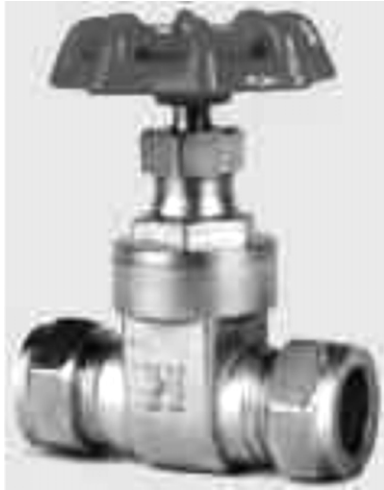
Fig. 2. Gate valve.

texts as quotations but although some describe and list guidelines separately, the majority have to be obtained by careful reading. There is also an element of repetition by authors of design texts but this is not a problem as it reinforces the use of certain guidelines. An important observation is that guidelines once isolated from their original text remove valuable qualifying information. This is not critical to understanding most of the guidelines listed below but stripped of detail can result in bland generic statements.